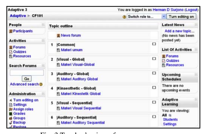
Fig. 3 Teacher's view of a course page

Teachers are responsible for devising and editing all the learning materials. When teachers want to make one topic of learning materials, they have to make the topic for all six types of learning mode accordingly. There is one additional section categorized as common that can be seen by all students. The common section may contain information such as course schedule, syllabus, discussion forum, etc. Figure 3 shows a teacher's view when they are editing a course page.