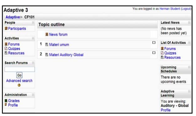
Fig. 4 Student's view of a course page